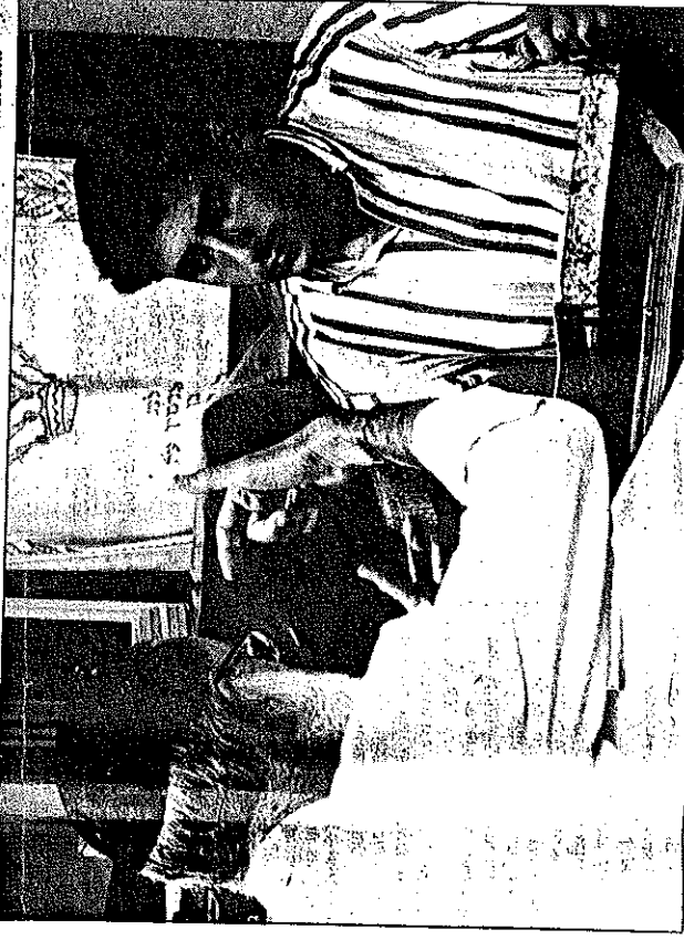
(Above) Christian students attending Jerusalem's Radissonne Center - where the focus is on Jewish studies - take some time off for fun. (Below) At Jerusalem's Yeshivat Darche Noam/David Shapell College, students delve into the complexities of Torah study in the Beit Midrash.

Through textual analysis, Midreshet Lindenbaum for women enables students to develop the ability to research and examine Torah texts independently - skills for a lifetime of Jewish learning.