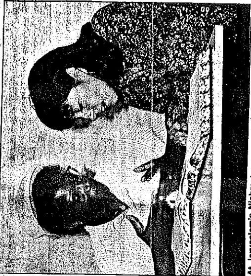
At Jerusalem's Nishmat, women study sacred texts together.